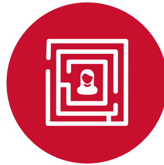
Case management systems