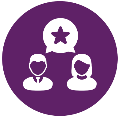
Managed Behavioral Healthcare Plans