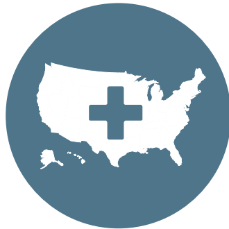
Population health management tools