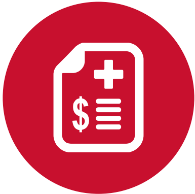
Health Insurance Plans

Who benefits from using a PHM Prevalidated Vendor