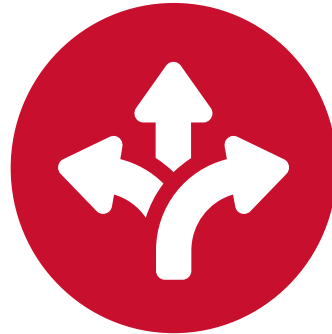
Risk stratification tools