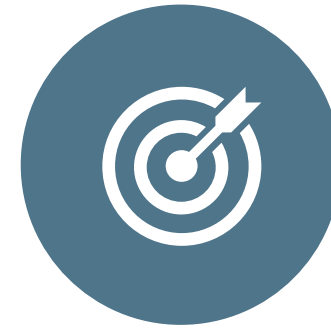
Population assessment tools